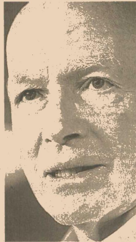
The "turnaround potential" for Asia is great amid growth in the region, said Mark Mobius, executive chairman at Templeton Emerging Markets Group

While there is "maximum pessimism" in emerging Asia, China is still an "enormous growth story" while India is expanding at a "very nice rate," Mobius said. In Templeton's view, the